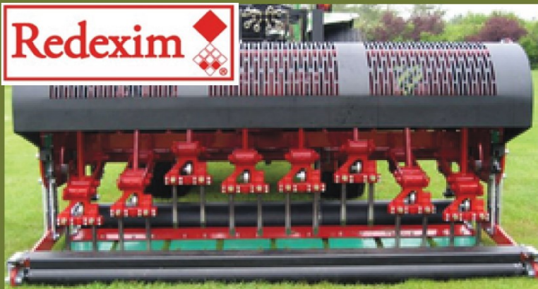
Redexim Verti-Drain Bullet 2216 & 2220 Aerator

The new Bullet machines are fast and strong, while penetrating nine inches into the soil. Depth adjustments can be made on the move using an optional hydraulic front roller.