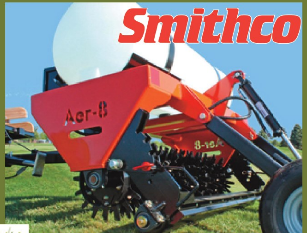
Aer-8 Linear Aeration System

The Smithco Aer-8 system utilizes 4 different tines to accomplish a range of essential aeration requirements. Available in 60" or 48" base units. Requires a tow vehicle.